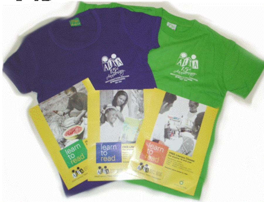
ALTA's 15 th Anniversary T-Shirts and bpTT-sponsored Flyers