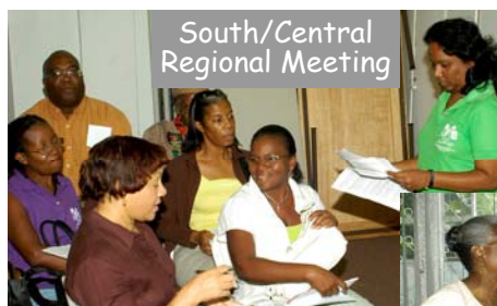
South/Central Regional Meeting