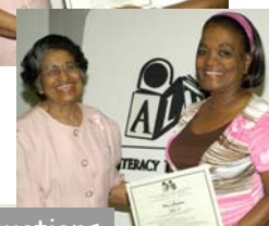
Lystra auctions concert tickets