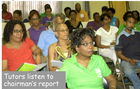
Tutors listen to chairman's report