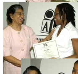
AGM Oct 2008